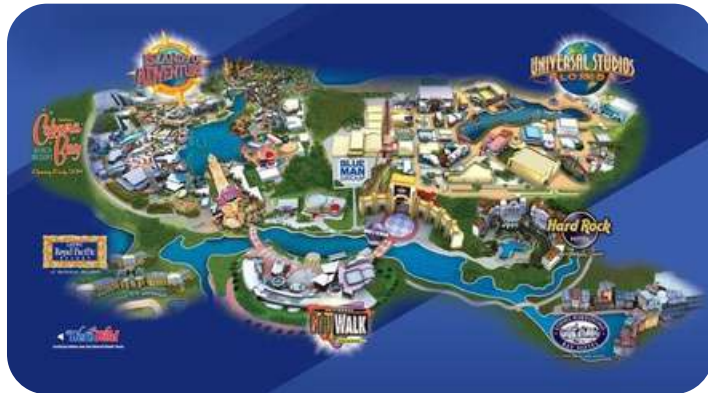
Map Of Universal Studios, Orlando, Florida